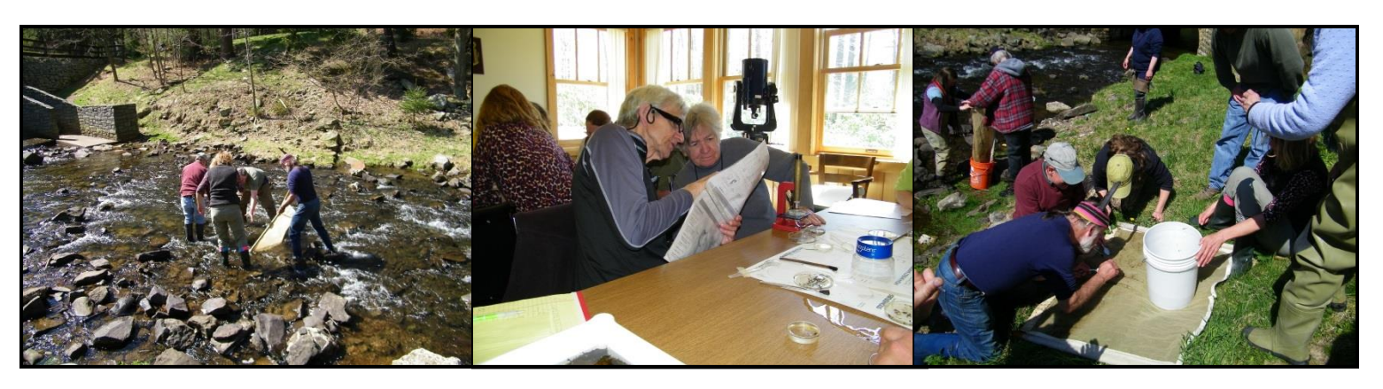
The C-SAW program is funded by a Pennsylvania Department of Environmental Protection Growing Greener grant awarded to the Pocono Northeast Resource Conservation and Development Council in Partnership with:

Alliance for Aquatic Resource Monitoring at Dickinson College Conemaugh Valley Conservancy Delaware Riverkeeper Network Pennsylvania Lake Management Society Stroud Water Research Center United States Geological Survey